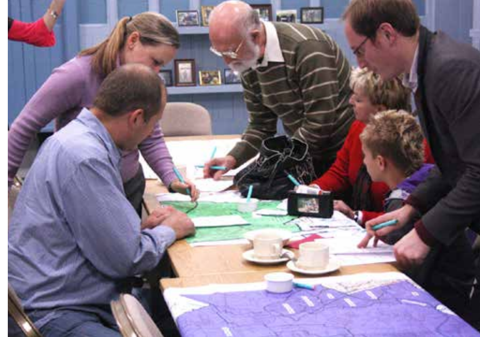
Participants at the final event of the project 'Take Me To' identify what matters to them on maps of the city

time needed to make things happen and the numbers reached with projects. This can be resolved with partners actively appreciating the opportunities present in these differences of scale. For example, small local arts organisations can be fleet of foot and more responsive in a way that a public service or local authority simply cannot be. There is also the challenge of meeting with the middle. The familiar dynamic of initiatives partnering with local authorities, such as Citizen Power, is the lack of real engagement with those in middle management roles who can feel that their capacity to engage is compromised by cuts and an undermining of their expertise. 46